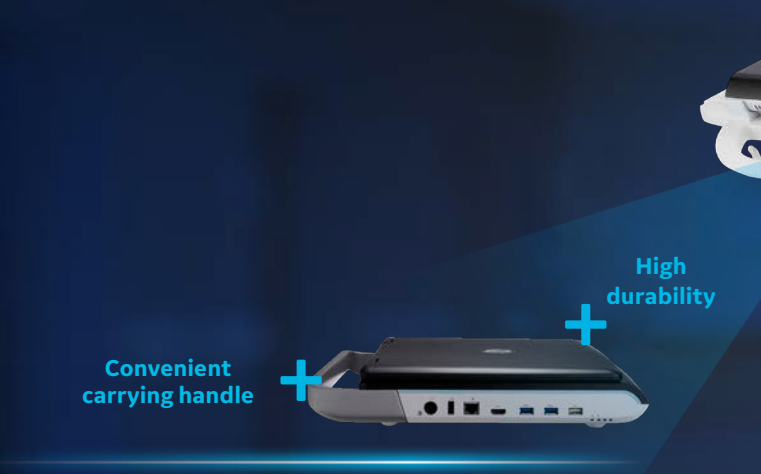
Light (5 kg/11 lb) and slim (57 mm/2.3 in)