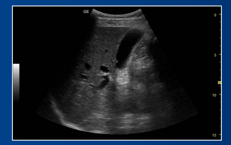
CrossXBeam<sup>™</sup> and SRI-HD to define structure borders clearly.